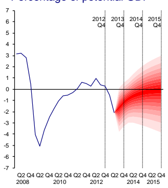
s. a. / Based on seasonally adjusted figures.

b) Output Gap Estimate, s. a. Percentage of potential GDP